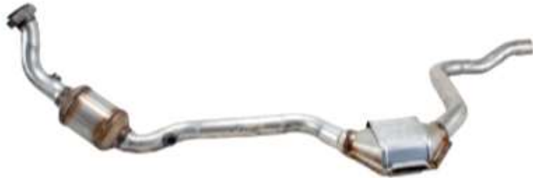
MB5211D (Left Side – Bank #2)