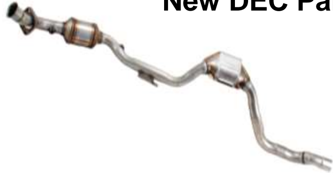
MB5211P (Right Side – Bank #1)