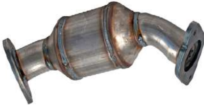
Left (Radiator Side) Bank #2